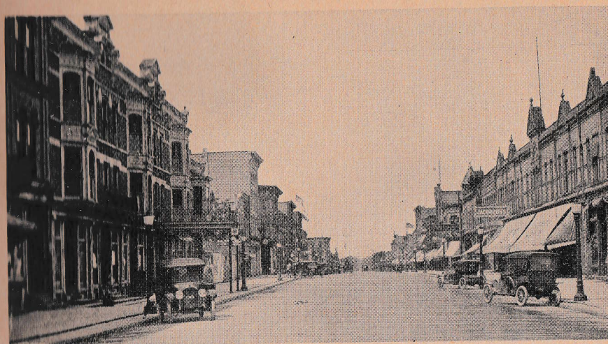
Main Street, Greenville, Mich.