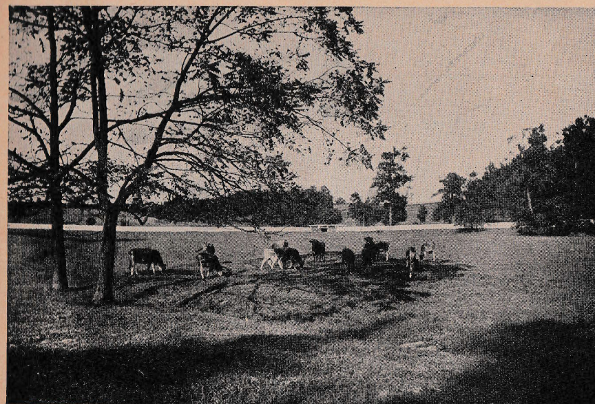
Peaceful, Prosperous and Profitable.

Your guarantee of fair dealing is the fact that they have been in the Coffee business in Grand Rapids for the past 40 years and are the oldest Tea and Coffee House in Michigan. Just send them your name and address and a Dollar bill and they will ship the goods by return mail. Safe Delivery Guaranteed.